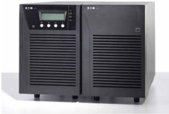
Add up to four EBMs for hours of runtime