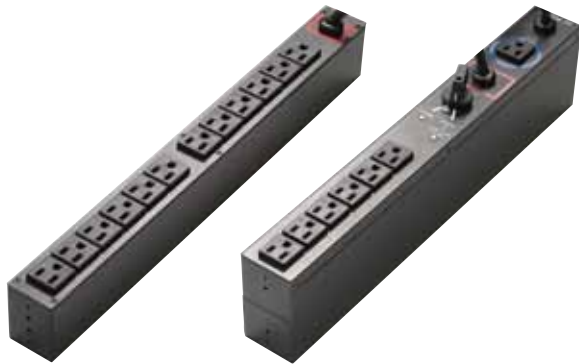
Optional FlexPDU and HotSwap MBP for greater flexibility and uptime