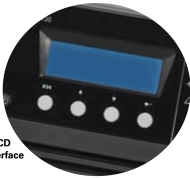
Bright LCD user interface