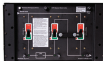
Front panel with cover removed